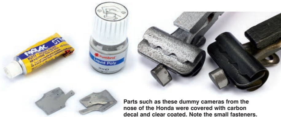
Parts such as these dummy cameras from the nose of the Honda were covered with carbon decal and clear coated.

White metal parts were prepared by coating with a mix of filler and Liquid Poly before sanding back to fill small imperfections.