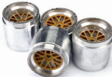
The yellow in the centre of the wheels is Halfords Filler Primer, useful for covering and levelling minor defects.

As I said earlier in this review, this Studio 27 Honda RA107 is the first larger scale multi-media kit that I have built and as such I almost talked myself into believing that the kit would be beyond my abilities. Having, as we do here at TMMI, to build it to a deadline for the magazine really didn't help this thought process. There must be many out there who think the same as me regarding their own abilities and kits such as this but take it from me, it is nowhere near as