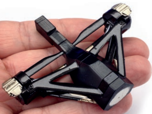
The completed gearbox locates into the body after assembly.

I was however brought down to earth a bit when it came to attach the front uprights. Whilst the nearside part (right hand side looking at the front of the car) looked in the correct position and at the right angle, the offside one certainly didn't. Basically, using the top attaching screw on the upright pulled about eight degrees of negative camber onto the wheel. After some measurement, this seemed to be down to the fact that the top wishbone on this side is in the region of 1.5mm shorter than on the nearside, pulling the upright out of position. Correction is relatively easy though. The top wishbone to upright screw is hidden under the wheel rim. The right position for the upright was attained and the ride height checked again, then the wishbone was simply glued to the upright with five-minute epoxy. On the finished model you wouldn't notice the fault, the glued part is hidden and all looks correctly aligned. Minty.