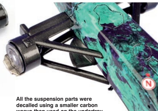
All the suspension parts were decalced using a smaller carbon weave than used on the undertray and wings.