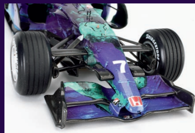
The chrome Honda 'H' logo was applied after the body had been clear coated just in case the lacquer attacked the chrome on the decal.

time so the positioning stayed. One note worth mentioning though, while gluing the parts I actually used epoxy glue as a filler too between the parts. Any excess of epoxy can be simply wiped off using a cotton bud soaked in methylated spirits. Works a treat and leaves no residue. When all the elements of the rear wing had been glued and cleaned up, it was trial filled to the chassis and a small amount of material removed from the wing mountings so that it would fit when paint, carbon decal and clear lacquer had been applied to the assembly.