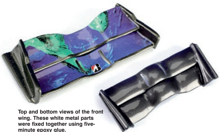
Top and bottom views of the front wing. These white metal parts were fixed together using five-minute epoxy glue.

and detail picked out. When this was done I have to admit that I was pleasantly surprised by the result! Add to this the photo-etch gear-change paddles that were also carbon decaled and my own wheel release mechanism made from various spare parts I had kicking around and I think this area looks absolutely fine. This was then attached to the dash panel after it had been painted, carbon decaled and lacquered, followed by gluing the assembly into the underside of the cockpit aperture.