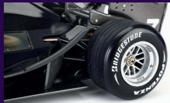
Tyres had their moulding seam removed and decals applied. The wheels and sidewalls were then satin varnished.