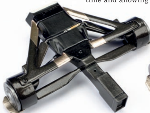
The top view of the gearbox shows the carbon decal and heat shielding on the wishbones added by the author.