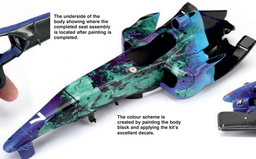
The colour scheme is created by painting the body black and applying the kit's excellent decals.