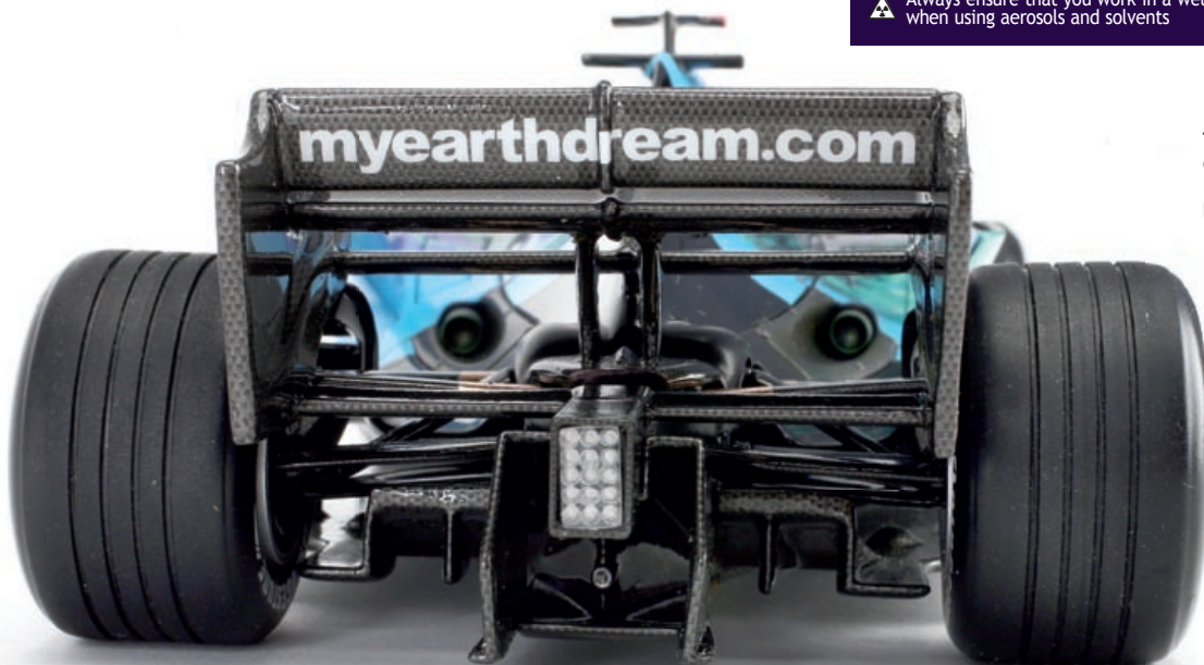
The only time most of the opposition saw this view of the Honda RA107 was when it was being lapped!