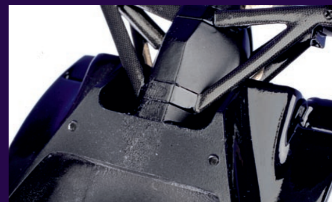
The underside of the body showing where the gearbox assembly is attached with epoxy glue prior to screwing the undertray in place.