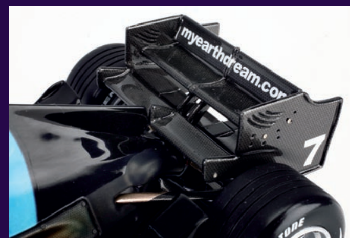
Templates were made using Tamiya Masking Tape for all the parts to be carbon decaled. This rear wing alone used over 30 decals!

Out with the Tamiya Tape and carbon decal again then. The rear wing was templated and completely covered in carbon decal, some 35 decals in total. Medium weave was used for the most part while the supporting struts were covered with the small weave to add some variation. The wing was then given three coats of Halfords Clear Lacquer after applying the kit numbers and decals. After leaving the wing a couple of days for the