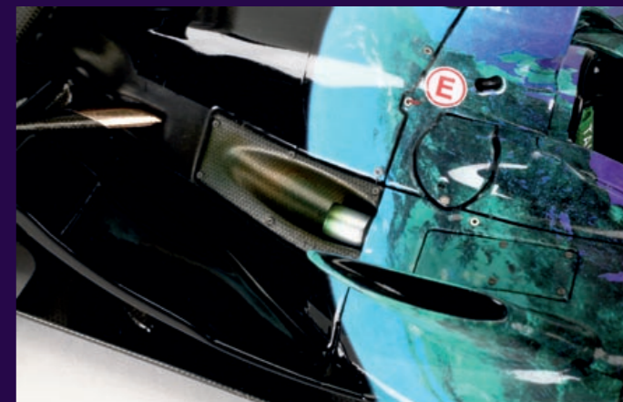
Exhaust outlet area was treated to carbon decal and heat staining using Tamiya clear colours before being finished off with a coat of matt varnish.

lacquer to fully harden, it was then fitted to the car, only needing a small amount of adjustment to the mountings before being committed using epoxy glue.