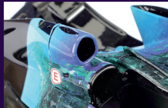
The airbox was deepened by using a dental burr in a Dremel. Care must be taken when doing this but it definitely enhances the finished model.

Basing the rear wing up with Halfords Filler primer, it was then sanded smooth in preparation for the gloss black paint. I thought it had all gone a bit too smoothly so far and disaster duly struck. The black paint developed a mass quantity of fish-eyes in the finish and no matter how much I sanded it back and reapplied the paint, they still appeared. The only solution was to start again as I figured it must be something in the primer coat, therefore the wing was treated to a brake fluid bath for a couple of days, thoroughly cleaned and the primer and