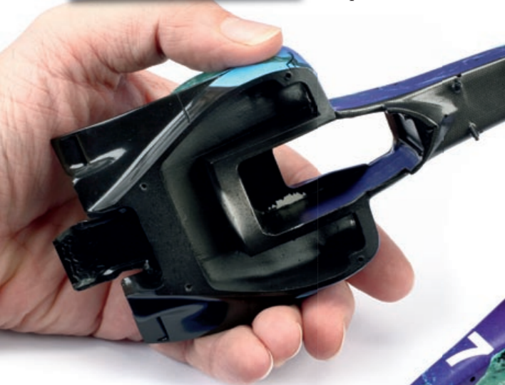
The underside of the body showing where the completed seat assembly is located after painting is completed.

The cockpit on the Studio 27 Honda consists of a cast resin seat which goes into the body underneath. The dashboard is taken care of by a cast white metal main panel and steering wheel. The seat simply needed painting black and the seat belts finishing and attaching (see separate panel) while dash panel needed painting and carbon decaling along with the steering wheel and detail picked out. Now this is where my only small criticism of this kit comes out. The steering wheel in inaccurate in shape for a start but I had big fears that the cast white metal part would just not look detailed enough and be difficult to finish. After pondering various courses of action including trying to remake the steering wheel, I elected to use the kit part and try and add my own touches. Therefore the steering wheel was painted, carbon decaled