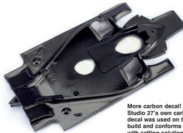
More carbon decal! Studio 27's own carbon decal was used on this build and conforms well with setting solutions.

At this point I made an executive decision, one which would lengthen the build time but in my opinion make a better finished model. Formula One cars are predominantly