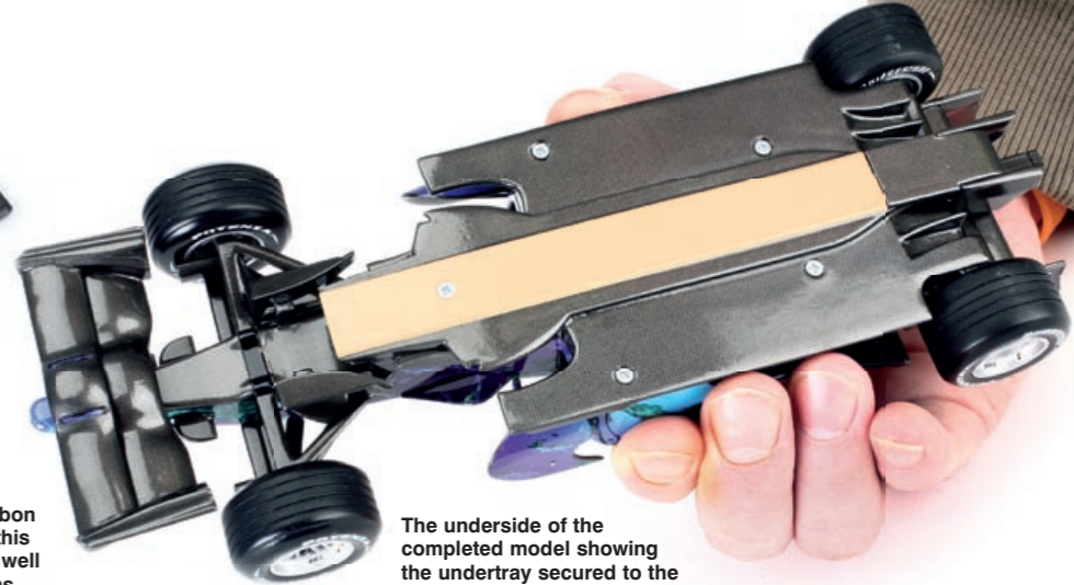
The underside of the completed model showing the undertray secured to the main body by small screws.

carbon fibre so therefore adding carbon decal was the order of the day and for this I would try Studio 27's own carbon decal. Two sizes of weave were used; small on all the suspension components and medium on the front and rear wings along with the undertray. This meant though that nearly all the model would be covered with decal!